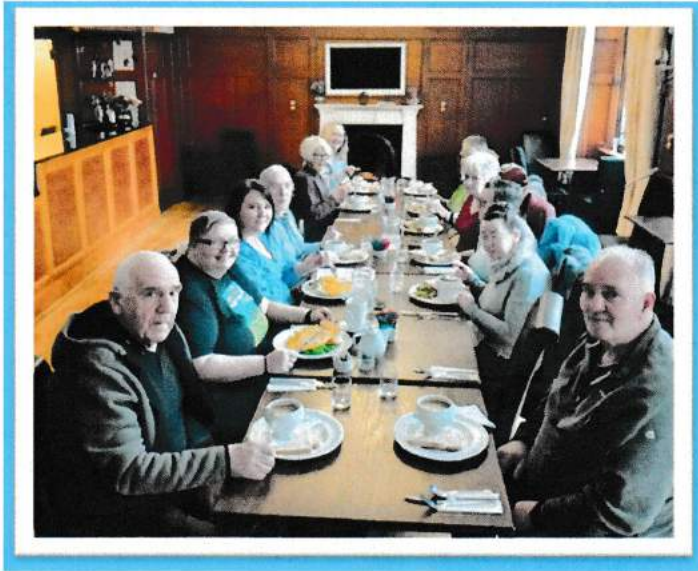
Lunch at the County Hotel

We were able to re-instate the Annual Carers' Outing this year. The last outing was in September 2019 prior to lockdown. The Outing on 28 February was to Stornoway. Those who attended enjoyed lunch at the County Hotel, a visit to Museum na Eilean in Lews Castle and then dinner at Eleven. A spin to North Tolsta was also fitted in.